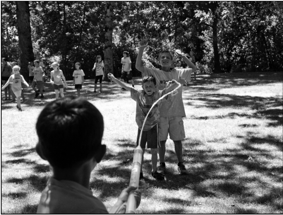
Two Junior Master Gardeners campers prepare for a refreshing blast of cool water on the last day of the three-day camp July 1. In addition to water games, they learned about insects, plants, forestry, pollination, germination and eating healthy.