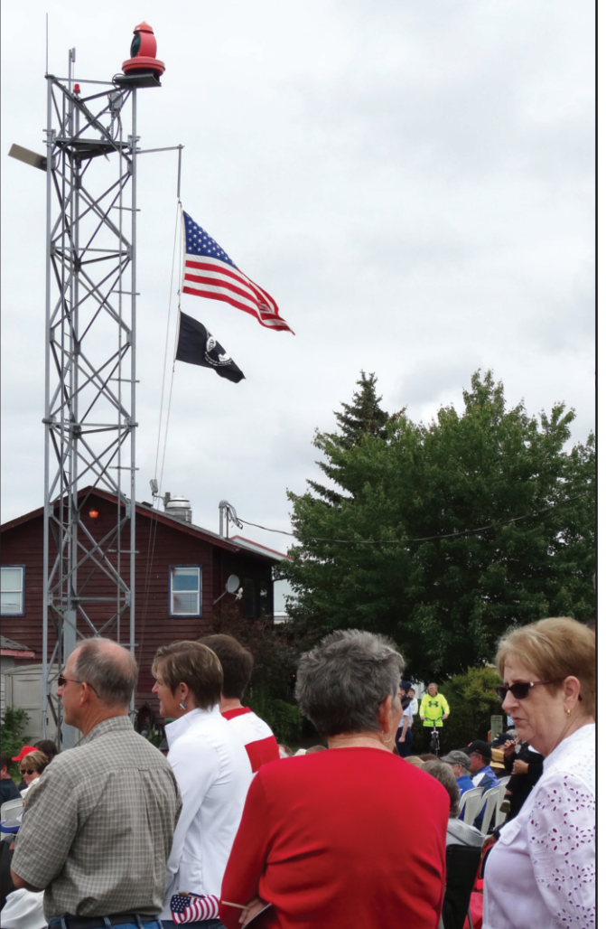
The flag at the Independence Airport flies at half-staff