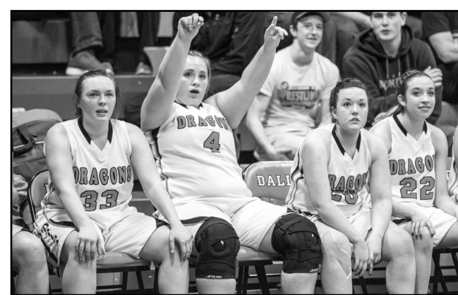
Dallas players watch during the Dragons' 54-30 victory over Lebanon on Feb. 25.