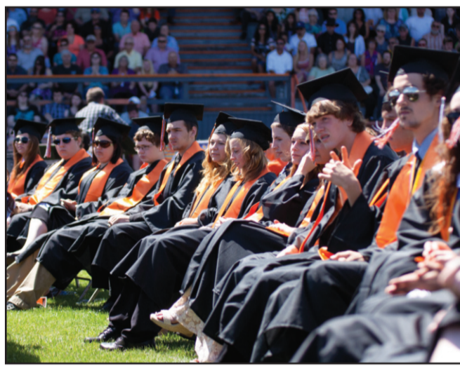
Members of DHS's Class of 2014 await their diplomas. Changes in the way the state calculates rates improved Dallas' percentage, but technically the graduation rate is down.