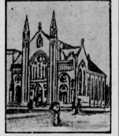
NEW CHURCH NOW BEING BUILT.

The church belongs to the German Reformed sect. Mr. Roosevelt is of the Dutch Reformed persuasion, his people having been attached to it for six generations before him in this country