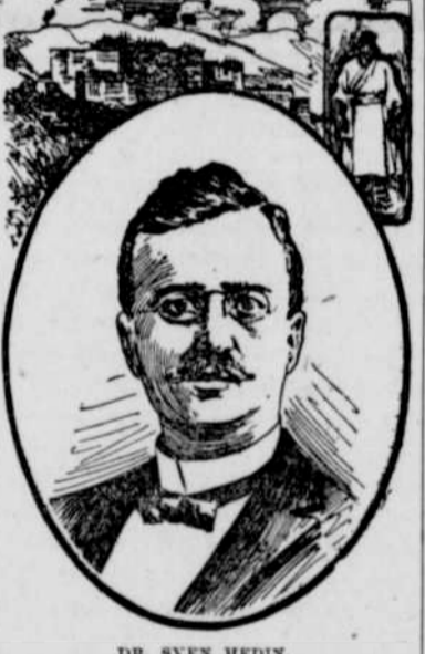
DR. SVEN HEDIN.

Four members of the Swedish travelers' party died on his recent exploration trip in Europe from the effects of the rarefied atmosphere there, even the valleys being higher than Mont Blanc.