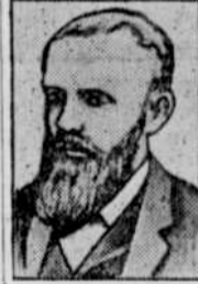
T. W. RUSSELL.

Thomas W. Russell, the member of Parliament who was stoned by a mob after addressing a political meeting in Ireland, is a Liberal Unionist, who has sat for Tyrone since 1896. Mr. Russell has his own ideas about reform in Ireland. While aggressively opposed to home rule he has consistently advocated the purchase of land for the benefit of tenants with an indemnification of something like $700,000,000 for the landlords. During the home rule agitation, when Gladstone's bill was before Parliament, he was an ardent anti-home ruler, and threw his influence in the landlord party. Since then he has changed his face, and, while still opposed to home rule, he is the vowed enemy of the landlord class, and the most persistent advocate of the land for the people by government purchase. Mr. Russell is a native of Fife, a graduate of Madras Academy, and an unusually vigorous, powerful and original statesman.