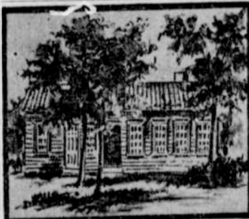
THE LOG HOUSE AT STEUBEN, N. Y.

Soldier of fortune that he was, the picture of a battlefield beckoning him on to glorious achievements could not be resisted by Baron Steuben. Details were rapidly made. Benjamin Franklin was in Paris, seeking a man who would enter the American army and establish the order and discipline so much needed by General Washington. Dr. Franklin could offer no assurances of financial support, could not even guarantee the reimbursement of the