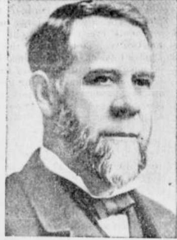
HENRY G. DAVIS Democratic Nominee for Vice President