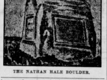
THE NATHAN HALE BOULDER.

It was in Huntington that the poet Walt Whitman lived and did much of his best work. His house is still stand-