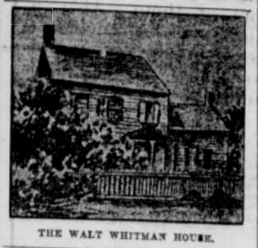
THE WALT WHITMAN HOUSE.

Huntington, L. I., Celebrates Its 250th Anniversary. President Roosevelt took part in the celebration of the 250th anniversary of the settlement of Huntington, L. I. There is a great deal of historic interest in the old town. In the days of British occupation during the revolutionary struggle Huntington's hills were vantage points whose strategic value were recognized. Numerous conflicts between British and colonial