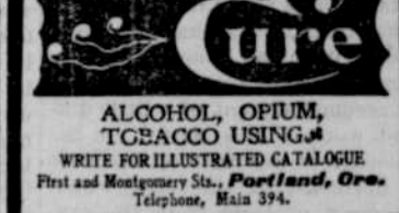
ALCOHOL, OPIUM, TGEACCO USING. WRITE FOR ILLUSTRATED CATALOGUE. First and Montgomery Sts., Portland, Ore. Telephone, Main 374.

Two 160 Acre Tracts and two 120 Acre Tracts of unimproved prairie land in Nebraska, clear title; will grow corn, oats, wheat, rye, alfalfa. Will exchange any or all for small saw mill, shingle mill, timber or ranch property in Washington or Oregon. A. B. NEWELL, Box 818, Seattle, Wash.