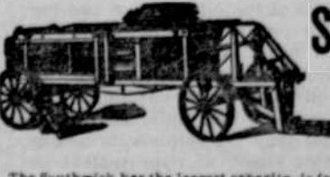
The Southwick has the largest capacity, is fastest and easiest worker of any Hay Press made. Send for catalogue. Mailed free.

Negotiations are in progress for fitting a certain number of light vessels round the coast of the British Islands with wireless telegraphy.