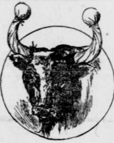
BULL WITH BOXING GLOVES.

And the sketch is fairly correct. The bull fights in the realms of King Carlos are humanitarian contests, not more