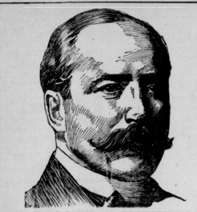
JUDGE ALTON B. PARKER AND HIS PRESIDENTIAL BOOM. Judge Parker, whose beom for the Democratic presidential nomination is now well under way all over the country, is chief judge of the court of appeals of New York state, the highest judicial office in the gift of the Empire State.