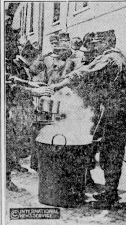
This photograph shows how hot food is served to the soldiers in the Italian army.