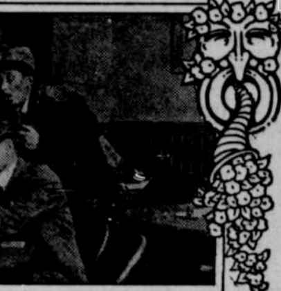
SCENE FROM "THREE KNAVES AND A HEATHEN CHINEE."

NOW that Great Britain has captured the international polo championship cup from the United States, the Yankee sportsmen are praying that a similar fate will not overtake the America's cup, emblematic of the world's yachting premiership. Sir Thomas Lipton, however, has a remarkably swift craft in Shamrock IV, it is agreed by impartial critics. The sloop has an abnormally high mast and consequently carries an immense spread of sail. She is said to be unusually fast in light airs and in smooth water, and weather conditions in September will have an important bearing on the result of the contests.