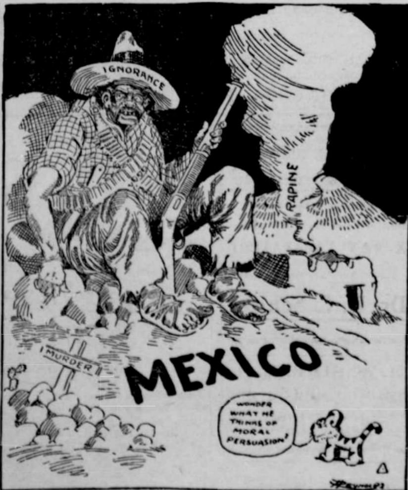
—Reynolds in Portland Oregonian.