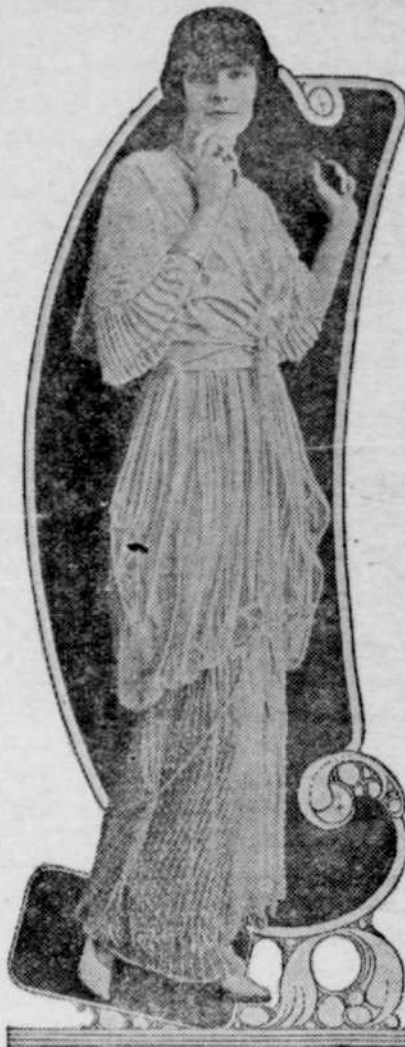
NEAT AFTERNOON GOWN.

Pannier effects grow rapidly in favor. Already they have passed the fad stage and are no longer eccentric, but pretty and graceful. The long clinging ones are rather ignored. They have given place to the extremely puffy and more bunched ones.