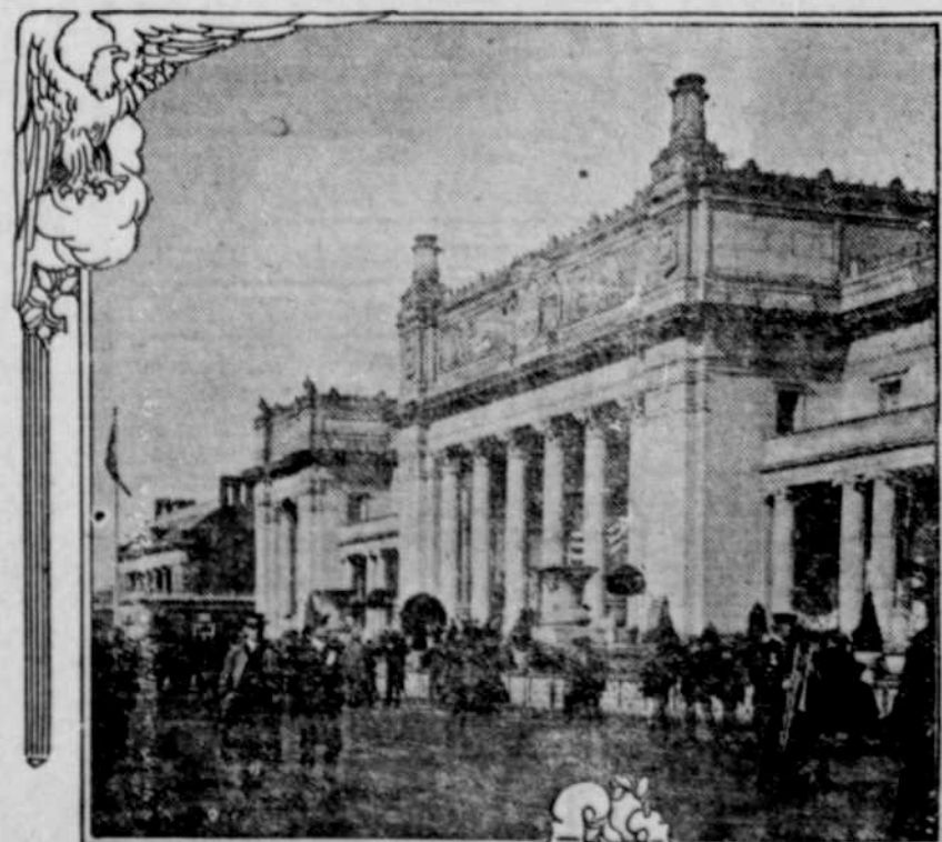
ON the Avenue of Commonwealths at the Panama-Pacific International Exposition. Crowds passing before the beautiful New York State building, which is one of the finest of the state buildings at the huge Exposition in San Francisco.