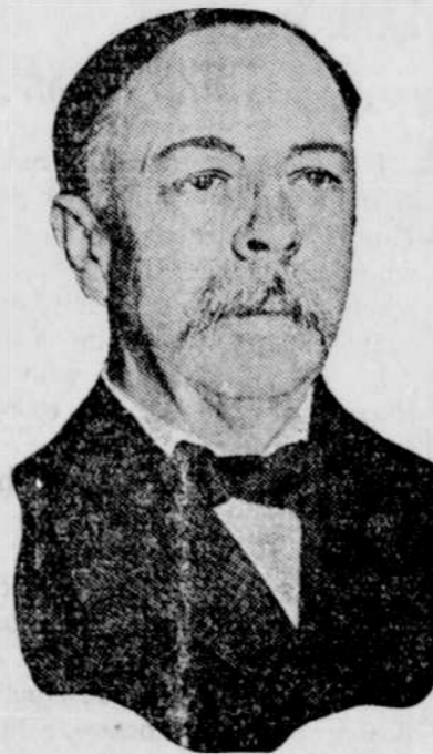
SENATOR GEORGE E. CHAMBERLAIN.

"The present session of congress has been occupied with matters which have taken all the time, so that little attention has been given to questions