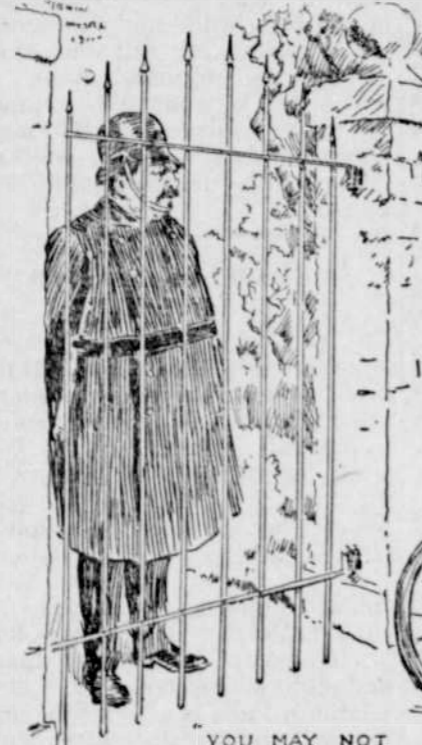
YOU MAY NOT

"The last train to London was at 10:25, and we had our orders for a carriage to be ready for him at five minutes to the hour. At ten o'clock precisely I took the liberty of entering the small library to inform Sir Andrew that the carriage was waiting, and that there was only just time to catch the train. He was not there, and the windows on to the terrace being open, I walked through to see if he was sitting outside, the evening being salubrious for the time of the