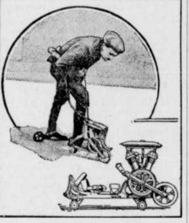
A Unique Motor Skate. Illustration, says the Popular Mechanics. The foot to which the motor-equipped skate is attached is set slightly ahead of the other foot, which rests on the non-powered skate. The latter skate might be designated as a trailer.