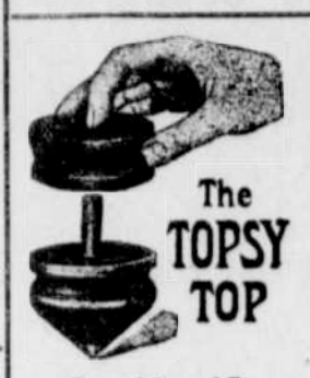
5c, 10c, 15c and 25c

Fairy Story and Picture Books for the little tots from