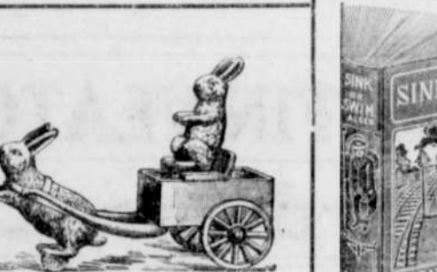
Bunny Iron Toy 10e

One guess with every 25c purchase of X mas goods.