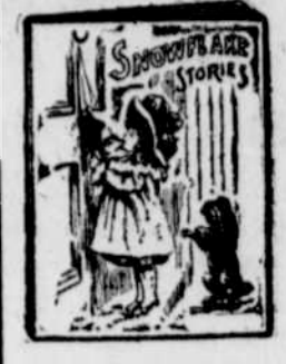
15c and 25c