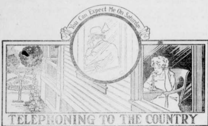
TELEPHONING TO THE COUNTRY

The only Baking Powder made from Royal Grape Cream of Tartar—made from grapes