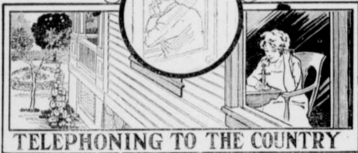
TELEPHONING TO THE COUNTRY

THE telephone has made it possible to do shopping and marketing satisfactorily, and with comfort, economy and dispatch.