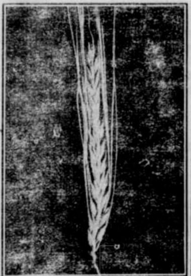
HEAD OF CHEVALIER BARLEY. Clean picking will cut an important figure in the valuation of the hops that will be entered for prize competition.

In the international barley and hop exhibition, which will be held in Chicago in October, 1911, the item of