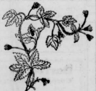
BRANCH OF FEMALE HOP FLOWERS. Vigor, ability, berry weight, uniformity, albumen (or nitrogen) content. These five divisions standing as credits, while penalties are provided for excessive amount of moisture, for trimmings (screenings, etc.), for inseparable admixtures, damage indicated by off color, off odor or by general impression and irregularity of growth.

The barleys will be valued on the basis of maturity, viability (germinat-