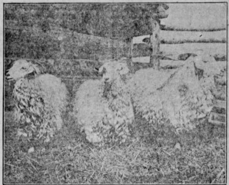
Angora Goat and Does.

One Animal to Acre Will Keep Briers, Weeds and Bushes Completely Subdued on Land That Is Inclined to Grow Up in Wood.