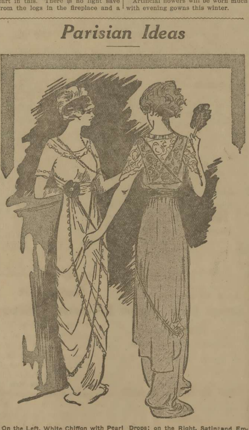
On the Left, White Chiffon with Pearl Drops; on the Right, Satin and Embroidery.