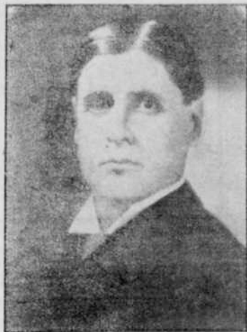
A guest of Cottage Grove Woodmen of the World.