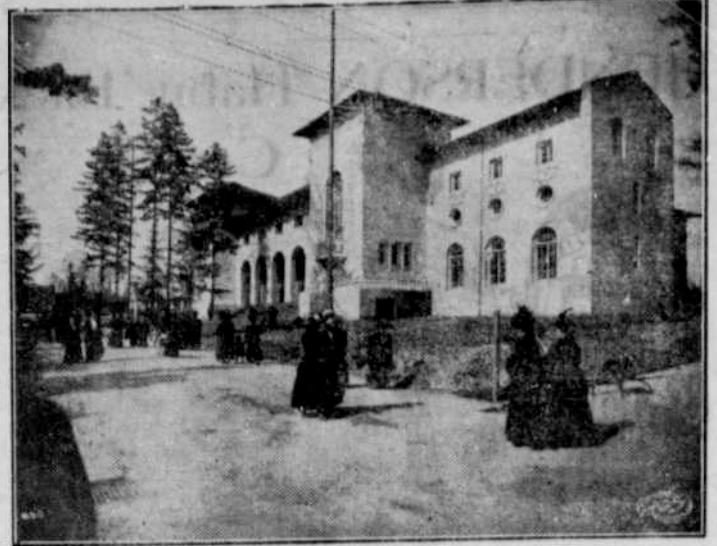
THE CALIFORNIA BUILDING AT A-Y-P. EXPOSITION, SEATTLE.

Ralston & Speer, Props. Surface water positively excluded from our wells. Sizes 3 and 4 inches. Phone 625 Cottage Grove, Oregon