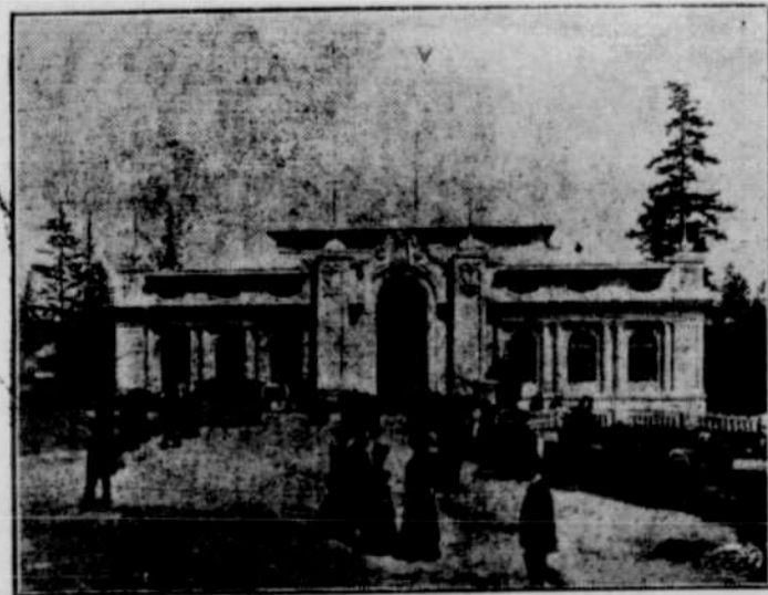
THE HAWAIIAN BUILDING, A.-Y.-P. EXPOSITION, SEATTLE.

In the foreground of the picture is shown the bank which slopes up from Geyser Basin at the Alaska-Yukon-Pacific Exposition, Seattle. Upon it have been planted 300,000 tufted pansy plants, and close up to the ballustrades high-growing plants of bright blossom. Above Geyser Basin can be seen the banks of the Cascades, and around these are growing 100,000 rose bushes, so selected that there will be a rotation of blooms throughout the Exposition.