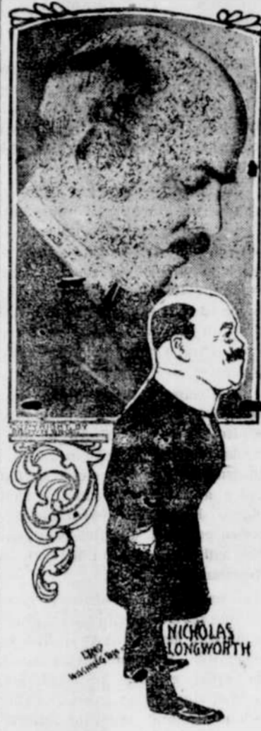
NICHOLAS LONGWORTH IN REALITY AND IN CARICATURE.

Congressman Nicholas Longworth has been quite fit the eye recently as a legislator as well as a citizen-law of the president. It was at his residence that the Republican members of the ways and means committee met to talk over tariff revision with President-elect Taft. Mr. Longworth is a member of the committee and has not been alto-