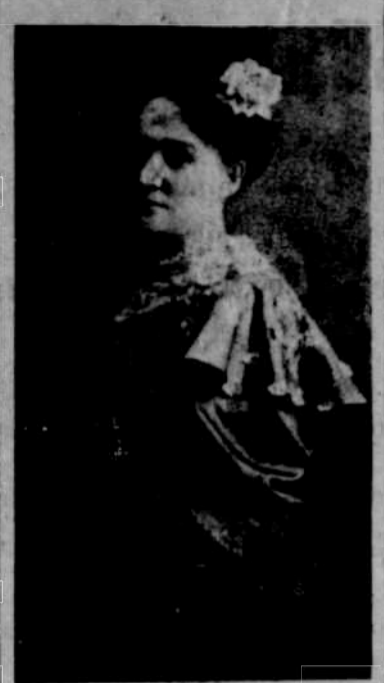
Lane County President.