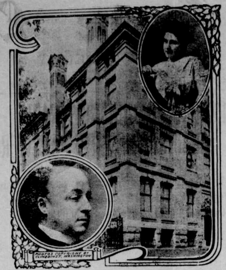
SENATOR KNOX, MRS. KNOX AND THEIR WASHINGTON HOME. Senator Philander C. Knox, who will become secretary of state when Mr. Taft assembles his cabinet, has one of the finest homes in Washington. It has been the scene of many brilliant entertainments, for the senator and his charming wife are noted for their hospitality.