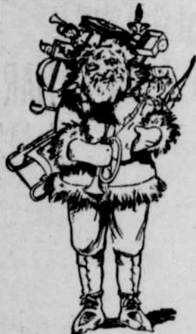
The Most Popular Man of the Day

Merry Christmas. Mighty little left of leap year. Old 1908 is becoming very thin. Albany is rubbering at its first electric car. What a valuable present a dozen nice fresh eggs would be. Venezuela is finding it a hard job to "beat the Dutch."