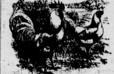
Over 200 eggs per hen per year is the Record of Arne Bros. White Leghorns.