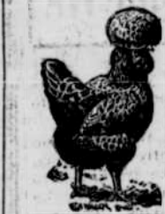
E. E. Bright's Famous Large French Houdan.

when they visited the show Wednesday. There were 120 coops, containing in all 335 fowls, on exhibition. There were the mammoth bronze turkeys down to the little bantam hens, and homer pigeons, and every one of them