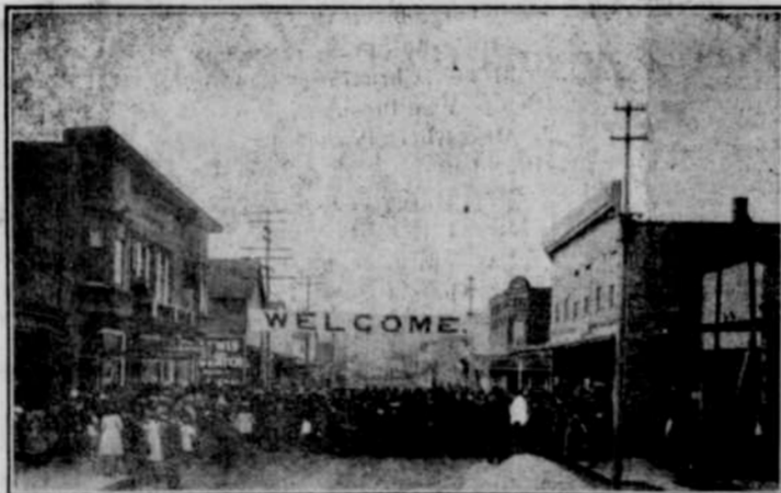
West Half of Main Street Cottage Grove.

The strong box was not touched. Express Messenger Huff was obliged to give up about $3.00 of his personal money, and the robbers quit the car, escaping in the darkness.