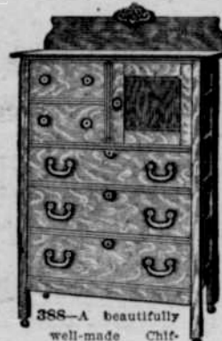
388—A beautifully well-made Chiffonier, 3 large drawers, 2 small ones and a large hat-box. Size 18x33, with casters. Given for using or selling $10 worth of our Products.