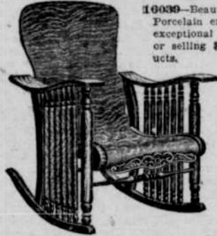
657—This beautiful comfortable, highly finished, quarter-sawn Oak Rocker given for selling or using $10 worth of our Products. Big value.