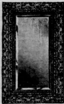
397—Beautiful Florentine combination gilt frame Mirror; size 18 x 40. French plate glass, ground bevel edge, given for using or selling $10 worth of our Products.