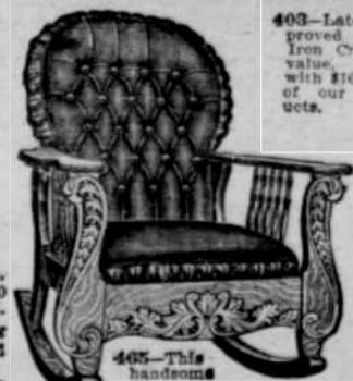
465—This handsome Morris Rocker, solid oak, beautifully finished, excellently unhoistered. Given with a $14 purchase of our goods.