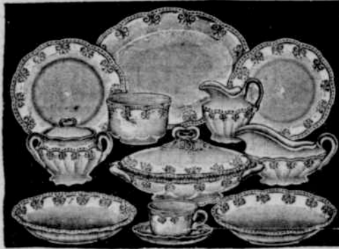
16030—Beautiful 100 piece White Porcelain embossed Dinner Set—an exceptional value, given for using or selling $10 worth of our Products.