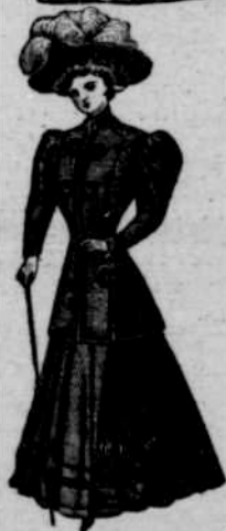
Wearing Apparel—in latest styles—well made of best materials by expert workmen. Given for using or selling $10 worth of our Products and up. We also give furs, hats, mufflers, etc., on the same plan. All shown in our Wearing Apparel catalog. Sent free if you ask for it.

In, given for using or selling $10 worth of our Products. Big value. Quality guaranteed to satisfy you.