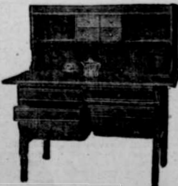
675—Kitchen Cabinet, complete with top. Given for using or selling $10 worth of our Products. Many other styles shown on page 25 of our Catalogue.