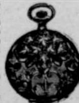
41012—Ladies O size Watch, Gold filled, 10 year warranted hunting case. Good movement. Given with a $10 purchase of our Products.