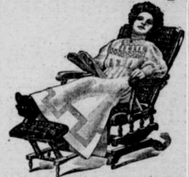
688—Swing Reclining Chair. This elegant, comfortable chair, given for using or selling $10 worth of our Products.