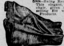
Blankets—An excellent pair of All Wool Blankets, size 70x80.

In, given for using or selling $10 worth of our Products. Big value. Quality guaranteed to satisfy you.