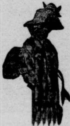
442—Beautiful American Marten Fox. Made with double fur throughout—trimmed with two mounted heads and six large fluffy tails. Given for using or selling $8.00 worth of our Products.