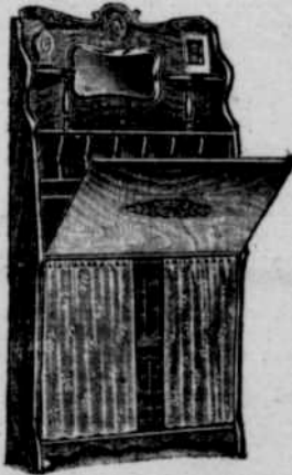
107—Solid Oak Desk. Has French bevel-plate Mirror, pigeon holes and shelves for books. Given for using or selling $10 worth of our Products.