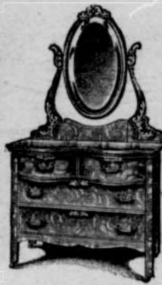
392—This beautiful Oak Dresser, with full serpentine front brass trimmings, French bevel plate Mirror, given for a $10 purchase of our Products.