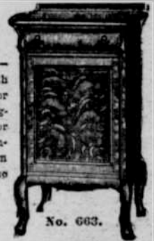
Music Cabinet—quartered oak with golden finish, or Birch with mahogany finish. Interior contains five compartments. Given with a $10 purchase of our Products.