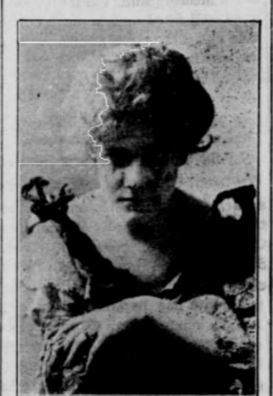
Leading Lady in "We are King."

small North German state, and a scheme is hatched up to exchange places with the king by his premier and other members of the court. The correspondent enters into the conspiracy with great enthusiasm, and until he gets the hang of being a king makes some of the most ludicrous mistakes imaginable. In the meantime the former king languishes in an asylum and as there is a striking resemblance between the two men it is not difficult for the arch-conspirators to keep him there under the announcement that he has an hallucination that he is the king, which of course he is. The company is excellent, the stage settings adequate and in one scene elaborate, and altogether "We are King" is put on and acted in a manner one expects at the high-price theaters. Probably, however, some of the audience felt they were being cheated with only a single pistol shot during the whole performance.—Oregonian. At the armory theater Friday evening. First three rows of seats $1, other seats 75, 50, 35 and 25 cents.