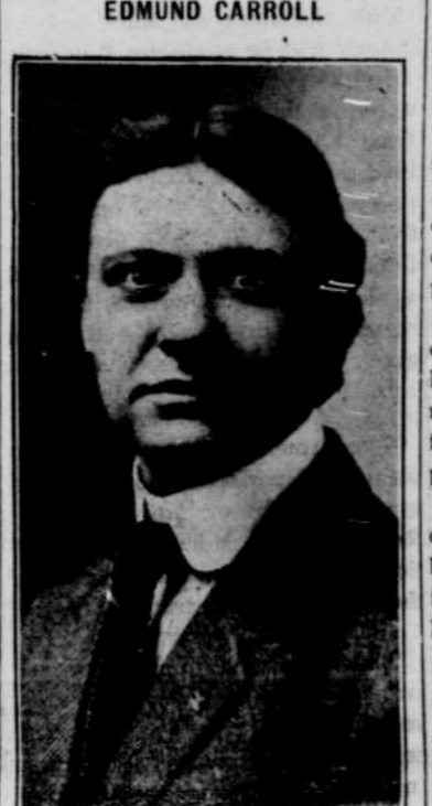
In "We are King"