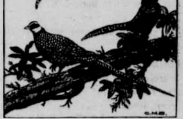
REEVES AND GOLDEN PHEASANTS.

The Reeves, from China, is the popular bird in England and especially