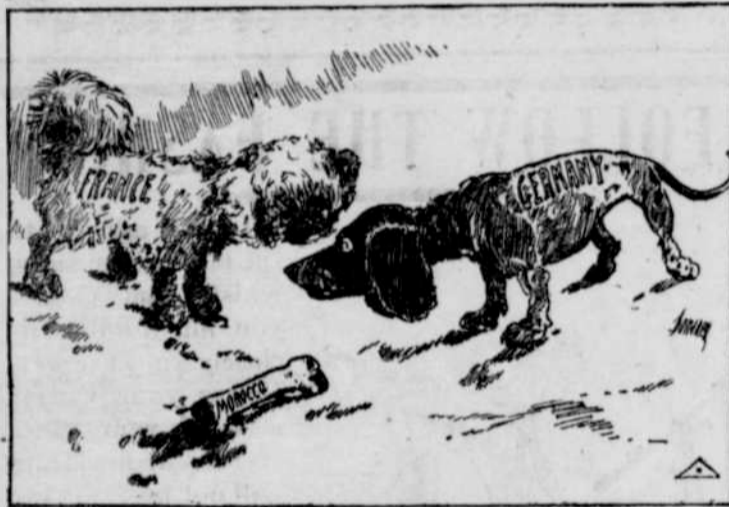
—Donahay in Cleveland Plain Dealer.