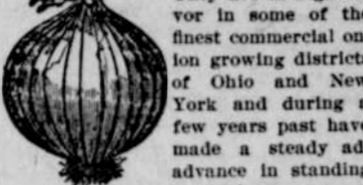
WHITE GLOBE ONION.

The white is one of those beautifully white, perfectly globe shaped onions that take the eye and bring highest price in any market. Its skin is thin and paperlike, the flesh fine grained, crisp and mild flavored. Add to this that it is a tremendous cropper, and it represents almost an ideal product in its line.