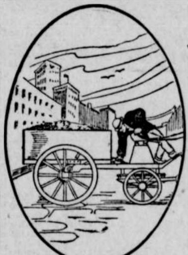
OPERATING THE DUMP WAGON.

The ease with which modern dump carts and wagons can be unloaded is illustrated in the automatic dump wagon shown in the accompanying illustration, the invention of a Connecticut man. The wagon box is pivoted on the