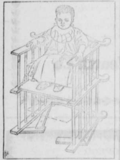
AS A HIGH CHAIR.

The crib and the high chair are two of the necessities of every household in which are young children. To combine the two in one piece of furniture is a recent invention of two California cabinetmakers. Besides serving the two purposes equally well, the appearance has not been slighted in the least, the combination being attractive rather than cumbersome. In the illustration it is shown in the position of a high chair, rollers being attached to the end frame. To convert the high chair into a crib it is only necessary to change the position, the rockers at the back of the high chair serving the same purpose as rockers on an ordinary crib. The seat in the high chair is readily removed and the necessary pillows and coverings inserted.