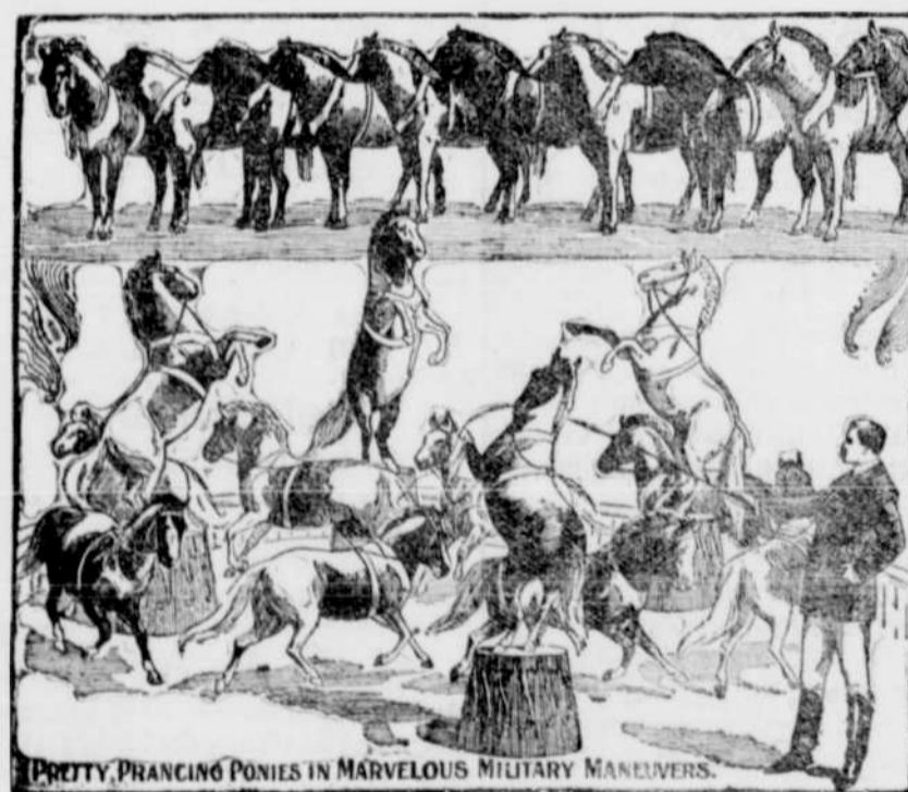
PRETTY PRANCING PONIES IN MARVELOUS MILITARY MANEUVERS.