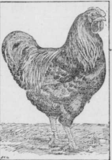
PARTRIDGE WYANDOTTE COCKEREL.

Now for a few words as to the points of the Partridge Wyandotte. The cock should have a rose comb, fitting close to the head and the peak pointing downward toward the neck, the beak being of dark horn striped with yellow. The eyes should be hazel, with a nice brown ring round; face and ear lobes red; neck, hackles and saddle feathers a beautiful dark lemon color, with black down the center of each feather; shoulders dark red; wing bars brown, edged with black; breast and thigh feathers black and brown, tail black, carried well back, and legs yellow, with four toes on each foot. It will be noticed that the breast should be black in color; but, as is the case with many of the black breasted breeds, the young birds are apt to throw brown feathers among the black, while some of the feathers are ticked with brown. These birds are no good for cockerel breeding, but if mated