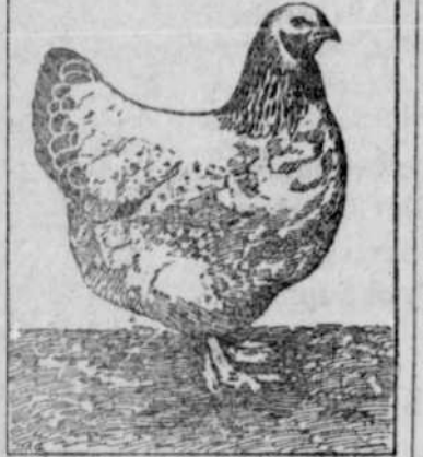
LIGHT BRAHMA PULLET.

The burrowing habits of the earthworm and the penetrating character of the roots of legumes exhibit a beautiful harmony of method and a striking example of effective co-operation between two ameliorating agents.