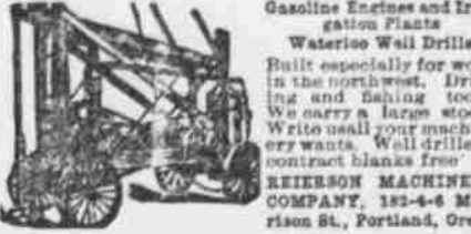
Gasoline Engines and Irrigation Plants. Waterloo Well Drills. Built especially for work in the northwest. Drilling and mining tools. Write us for a large stock of machinery. We will drill or contract to drill for you. BRIDGESON MACHINERY COMPANY, 123-4th Merriam St., Portland, Ore.