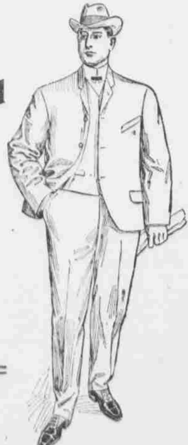
FRIEND BROTHERS CLOTHING CO. ASTORIA, ORE.