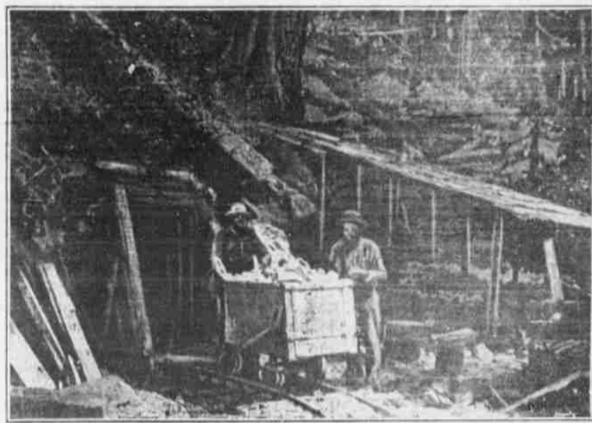
A Bohemia Tunnel.

They treat deafness with an entirely new method. Hearing restored to many at once. Cataract in all its various forms cured so that it will