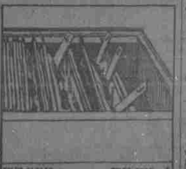
SECTION UP A TESTING TRAY

One of the quickest and most convenient devices for making germination tests is that first used by Frobenius of Galt at the Geneva Station in New York.