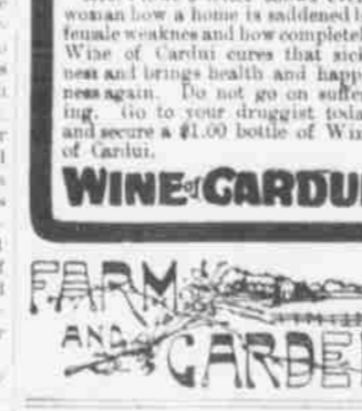
JERSEY'S NEW SWEET CORN

176 Warren Avenue, CHICAGO, ILL., Oct. 22, 1902. For nearly four years I suffered from ovarian troubles.