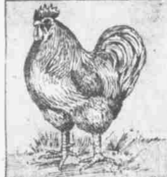
GOOD TYPE OF ORPINGTON MALE.