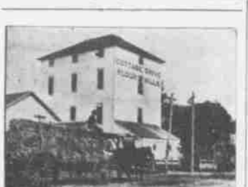
Cottage Grove Flour Mills, Cottage Grove.

and trailing, each from 30 to 140 feet long. They are being got by the Pacific Lumber Company for use in different sections—piling dressed ready to be driven into the earth, of immense length and straight as a rule, shipped for hundreds of miles, simply because it's here where the supply is to be had. Any man on business intent and looking at Cottage Grove and the enterprises that are under way and others being developed, would soon decide that it was the place to stay and realize a share of the great prosperity that abounds here. Eighteen thousand passengers coming in and going out of this town year-