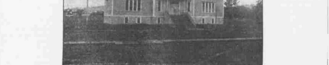
PUBLIC SCHOOL BUILDING, COTTAGE GROVE, OREGON.