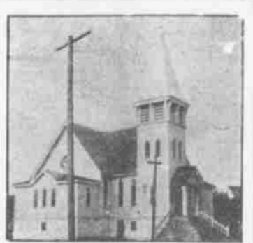
Methodist Episcopal Church, Cottage Grove.

estimate is twenty billions of feet, something the average mind cannot grasp at, and right here it may be stated that at Cottage Grove we are centrally located right in the midst of what is known as one-third of the entire timber region of Oregon. There are several large saw mills—big lumber companies—but there is room for a score more of them and plenty of room. As a fact, it may be stated that a well managed saw mill can clear 50 per cent on their investment, this said by experts to be underestimated, and let it be clearly understood that the demand for lumber keeps increasing. The raw material is here, but we want the finished product. This is a great opportunity to saw mill men. There are now five saw mills in and