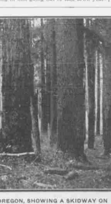
TIMBER SCENE IN LANE COUNTY, OREGON, SHOWING A SKIDWAY ON WHICH TO TRANSPORT LOGS.

When you remember the number of men engaged on the outside of Cottage Grove in mining, lumbering, road building, prospecting, etc., all of whom have to be fed from this town, supplies from here of all kinds, that no matter how many may locate there will still be ample room for more to satisfy the present population and the growth is much more rapid than the producer from the land can supply. These are the simple, truthful facts. The men who come here to engage in business will have to hustle; there are no drones around, but the hustle will be a big dividend payer. The greatest lumbering district is right here. The greatest gold-bearing district is here that is in the state and one of the greatest in the United States, and it will not be long before that will be generally conceded. Therefore, with all these most exceptional opportunities at hand, small wonder will it be when you are asked "Where are you going?" you answer "I am going direct to Cottage Grove, Lane county, Oregon." It might be well to state that the hotel accommodations in this very busy town are at present adequate to take care of all visitors very satisfactorily. Taking that in connection with the good transportation facilities, the visitor who comes with the intention of looking over the ground will find his comforts well taken care of and treated courteously by the board of trade and other officials connected with Cottage Grove.