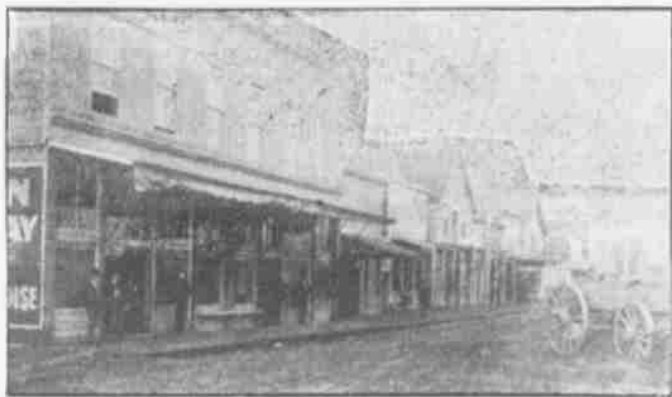
STREET SCENE IN COTTAGE GROVE, OREGON.

One that is not surpassed by any city in the United States. The water is obtained at the nearest hot springs, brought to the city by mains, and distributed to its absolute purity to each household at a cost of 25 cents per month. The city owns the system. The population of this highly progressive town has doubled within the last three years. There is an energetic board of trade—men who take an active interest in the welfare and upbuilding of their city. Two really excellent newspapers are published weekly in Cottage Grove—the Bohemia Nugget, and the Lane County Leader, here again are two influential forces working for the town's progress. With a board of trade and two popular local journals working harmoniously together, all for the building up of a community, small wonder if they succeed—which assuredly they do, and they are a shining example to many towns in the Willamette valley to go and do likewise. There are several industries in operation but what a lot of opportunities there are here! You may learn a few as you read on.