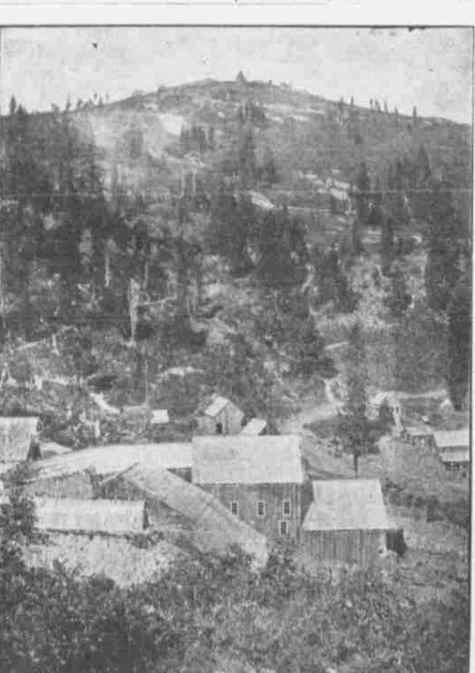
VIEW OF THE MUSICK MINE, BOHEMIA, NEAR COTTAGE GROVE, NOW ABSORBED BY THE OREGON SECURITIES COMPANY.

at your very door. The great need is for small farms—and a lot of them; they would be here little gold mine producers. One of the great sources of wealth is