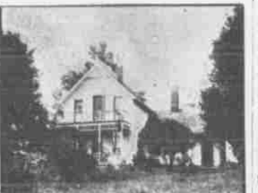
Residence of Hon. Darwin Bristow, Cottage Grove.

Mining is one of the most important of the main, great industries of this section. There are over two thousand claims of record. The mines and kindred companies are considered to be the finest properties on the whole of the Pacific coast; large sums of money have been and are being expended in this industry for modern machinery and improved methods to extract the precious metals from the vast mineral deposits in the near-by mountains. There are two great mining districts in Lane county—Bohemia and Blue River. These mining camps are in the Cascade and Calapoosia ranges and separated by a distance of but twenty miles. In both the experimental stages have passed and the future is assured. Our purpose is now to deal with Bohemia. It is located thirty-five miles southeast of Cottage Grove in the Cascade and Calapoosia ranges, partly in Lane and Douglas counties, as the county line crosses the higher peaks of the district. There are now twenty large corporations operating in this district, principal of which is the Oregon Securities Company, a capital of $5,000,000 owning