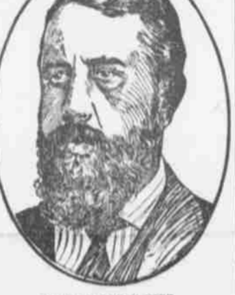
DUKE OF DEVONSHIRE.

He is what people call a safe man. As to actual work in the field of politics, he has done as much as most men, while at the same time guiding important business interests at Barrow, Eastbourne and elsewhere. He is now 70 years of age, and has been in Parliament since he was 24.